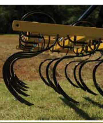
High Vibration Tines