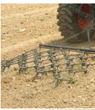
Pull Chain Hitch