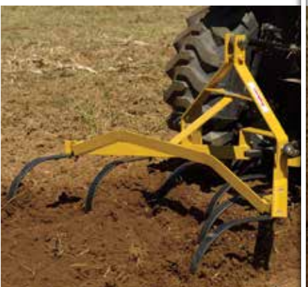
High Ground Clearance