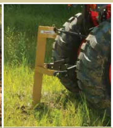
Break-up Hard Pan