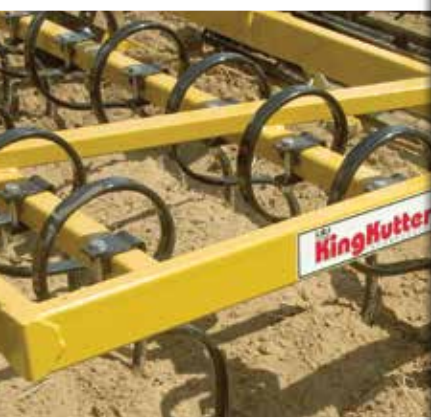
High Vibration Tines