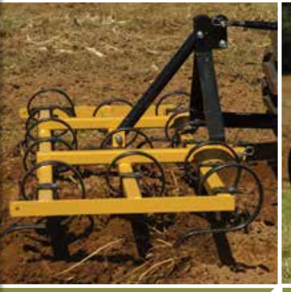
Tube Frame Construction