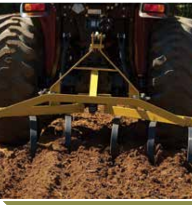
Spring Steel Tines