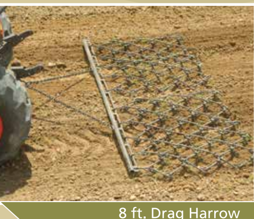
8 ft. Drag Harrow

Prepare the soil to plant. Make furrows to plant potates. Cultivate your sweet corn patch. Loosen compacted soil. Renovate and dethatch pastures. King Kutter's Tillage Tools are the best the industry has to offer for landscapers, contractors, and farmers with large gardens or small acreages. From seedbed preparation to cultivating, we have the tillage tools you need to make sure your garden or small acreage reacheds it's potential.