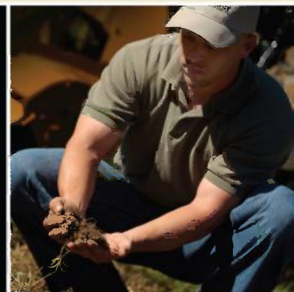
Ideal Seed Bed