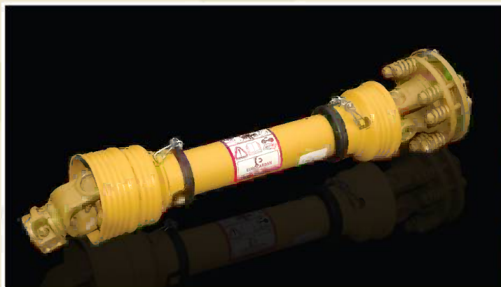
Slip Clutch Drive Line Standard

Every King Kutter Tiller is built to perform year after year. There's a certain satisfaction that comes from doing the job right. Whether you have tough sod, or hard compacted ground, King Kutter Gear Drive Rotary Tillers will get the job done. Producing an ideal soil mix is what King Kutter Tillers are all about. With six tines per flange, you can till down to eight inches. There are five models designed for your ground and your tractor. The 4' TG-48-XB is ideal for sub-compact tractors. The 4' TG-48 is ideal for 20 to 35 horse power tractors. The 5' TG-60 model is designed for the most popular compact tractors in the 25 to 40 horse power range. Choose the 6' TG-72 model for tractors with 35 to 50 horse power. The 7' TG-84 is perfect for larger operations and ideal for use on tractors from 50 to 65 horse power. The choice is yours, five quality Gear Drive Rotary Tillers that are built tough and will give you years of dependable performance.