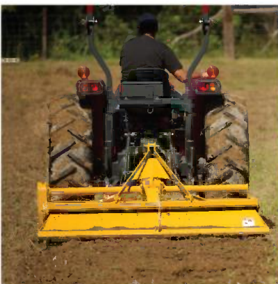
Heavy Duty Frame