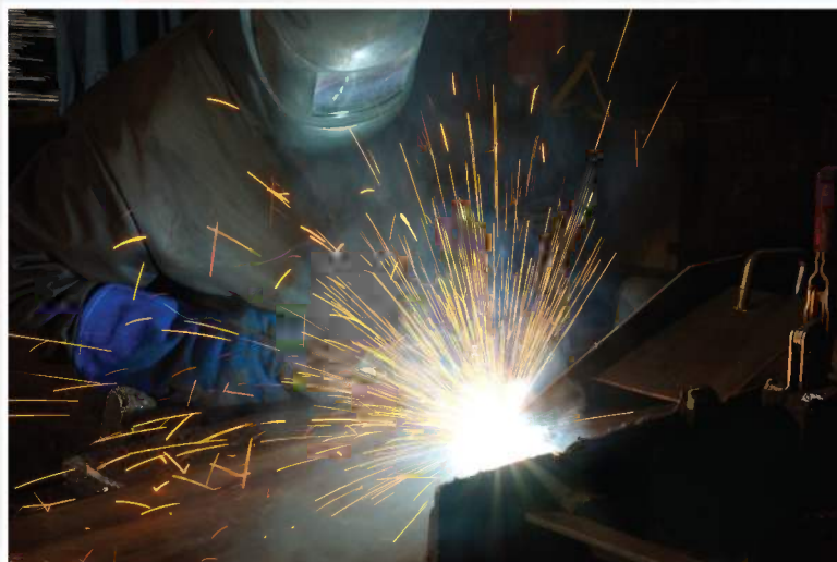
Built Tough to the Highest Standards

*Weights are for products only. Does not include packaging material.