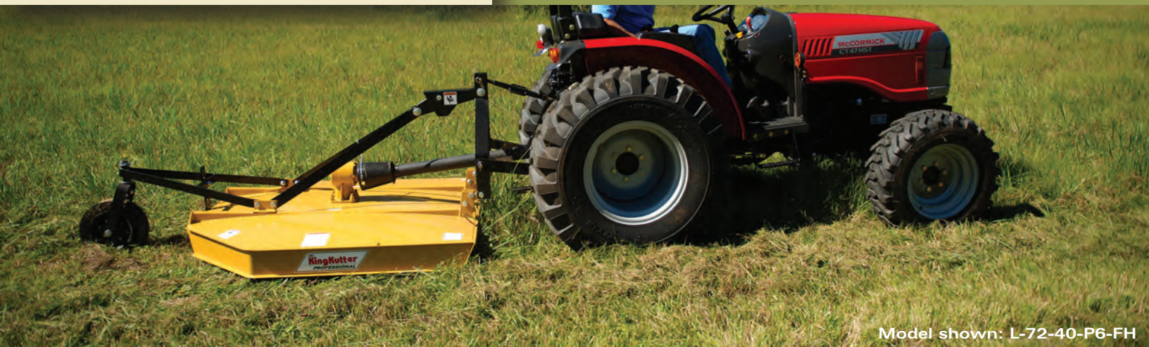
Model shown: L-72-40-P6-FH

King Kutter's Flex Hitch Rotary Cutter demonstrates the latest in Rotary Cutter innovation, and it's only available from King Kutter Inc. The Cat. I quick hitchable, flex hitch design, is unlike anything on the market today. The unique hitch allows it to roll 15° up or down, on the left or right side of the machine. This feature allows the Flex Hitch Rotary Cutter to follow the contours of your field like no Rotary Cutter before. The domed deck design sheds water and debris to prevent material from collecting on the deck. Whether mowing pastures, roadsides, parks, or easements, the King Kutter Flex Hitch Rotary Cutter is perfect for you.