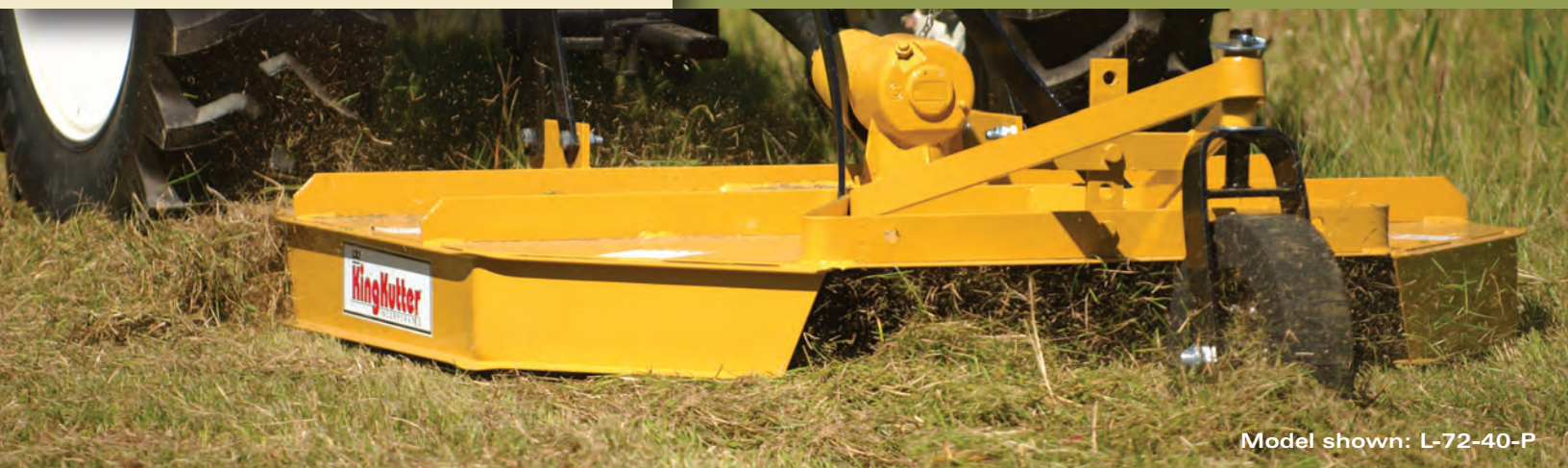
Model shown: L-72-40-P

King Kutter's Rotary Cutters are quality constructed, durable Cutters that are built to last. They are made with rugged "I" beam side rails, and a single sheet top deck that is fully reinforced with cross and spider bracing. A rugged gearbox and stump jumper, adjustable laminated tail wheel, and shielded PTO shaft will provide years of service. These Cutters are available as lift type or pull type.