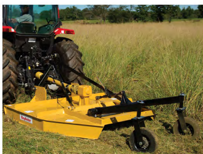
Dual Tailwheel on 6 ft & 7 ft