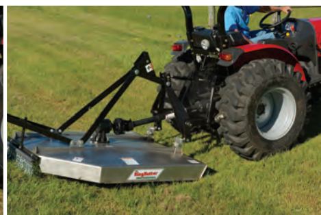
Optional Slip Clutch