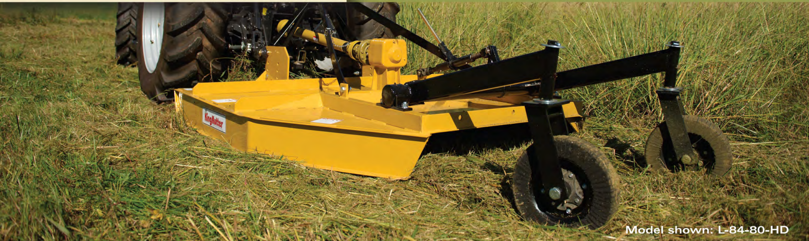
Model shown: L-84-80-HD

King Kutter's Heavy Duty Rotary Cutters are designed to meet the demands of today's Farmer. This Cutter is built to perform. Durable, heavy-gauge 8" "I" beam side rails, and a fully reinforced 3/16" thick top-deck will stand up to tough conditions. HD gearboxes and slip clutches and dual laminated tail wheels (6ft & 7ft models) are features that are standard on a King Kutter Heavy Duty Rotary Cutter. These Cutters are available as lift type or pull type.