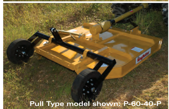
Pull Type model shown: P-60-40-P