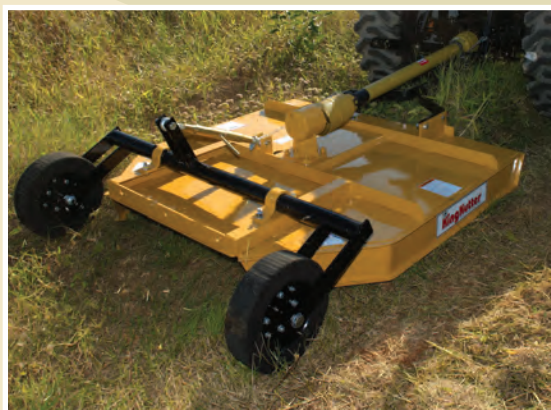
Pull Type Rotary Cutter

King Kutter Rotary Cutters are designed, built, and manufactured to last. Tough decks, sturdy "I" beam side rails, rugged durable gearboxes, and laminated tailwheels will provide dependable service for many years to come. We have the right Cutter for your needs, starting with the original "I" beam models, Heavy Duty Cutters, XB Sub-Compact Cutters, and our newest patented Flex Hitch, Domed Deck units. The Flex Hitch Cutter is also available as a stainless steel model, a King Kutter exclusive. Maintain your property, promote healthier pasture growth, or mow property easements with a King Kutter Rotary Cutter.