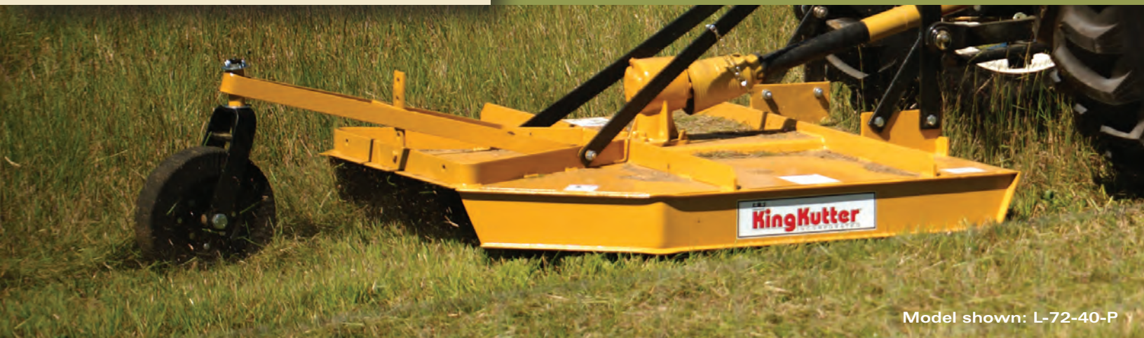
Model shown: L-72-40-P