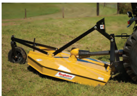
Patented Flex Hitch Design