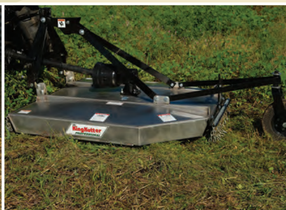
Optional Stainless Steel Deck