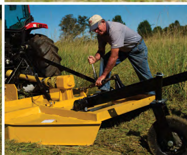
Easy Tailwheel Adjustment