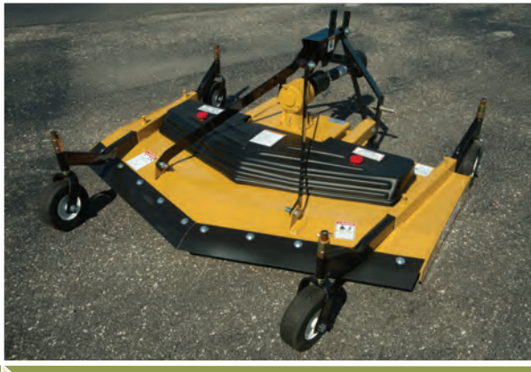
Sturdy 3/16 in. Thick Deck